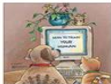
Twin Your Human