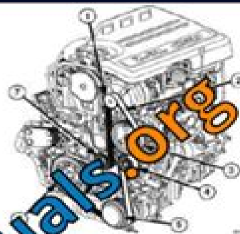
Fig. 24: Accessory Drive Belt Routing - 1.8L Diesel