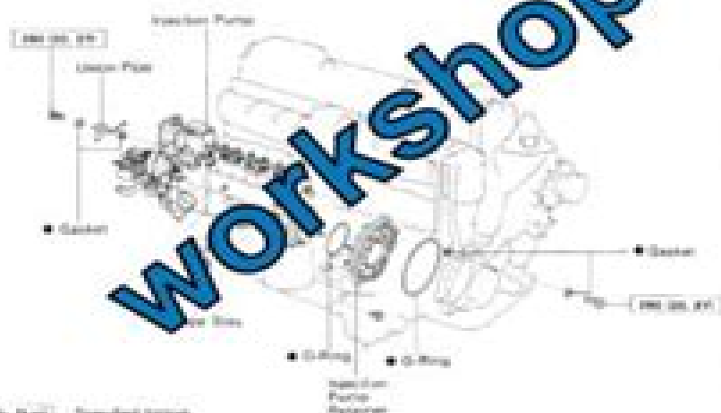
Fig. 25-15, 25-16 Detailed Section ● Non-removable part