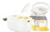
Medela PISA MaxFlow™