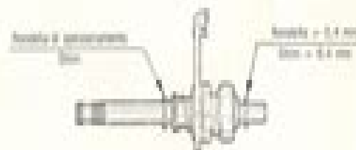
Fig. 29 Gruppo ventole Carter con ventole