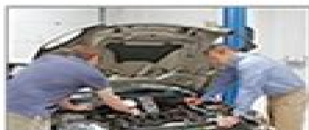
Bentley technician testing fuel pump on the Cooper S engine.

Though the do-it-yourself MINI owner will find this manual indispensable as a source of detailed maintenance and repair information, the owner who has no intention of working on his or her car will find that reading and owning this manual makes it possible to discuss repairs more intelligently with a professional technician.