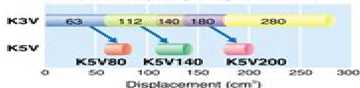
•Variation of pump displacement

With new technology the K5V series has enabled increased power density.