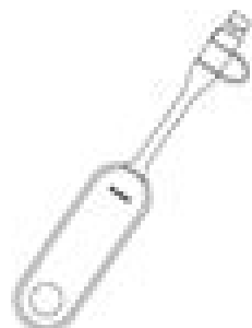
Quick Start Guide (V1.0)

English | 简体中文 | Deutsch | Français | Español