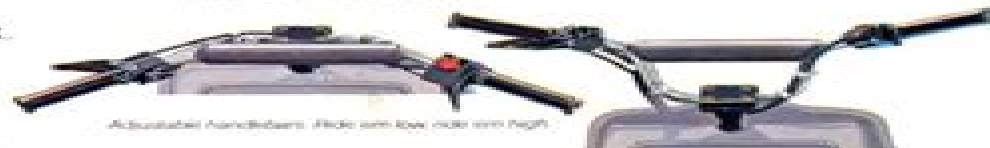
Adjustable handlebars. Ride with low, ride with high.