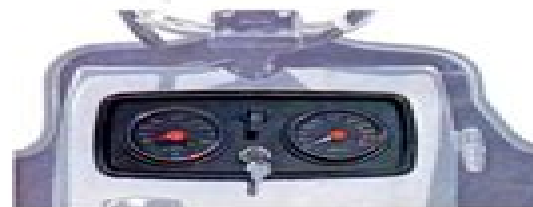
Full instrumentation, including speedo and tach.