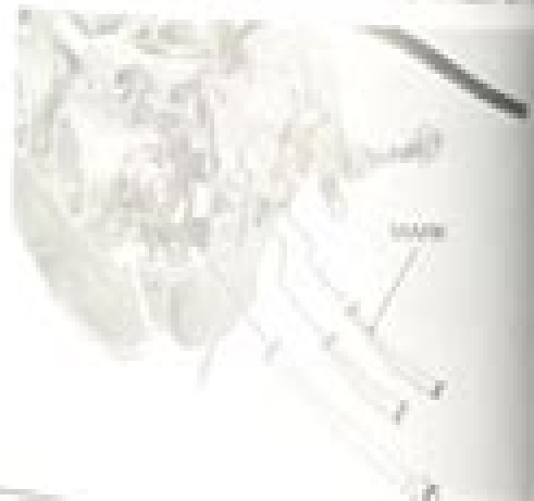
Figure 1. The diagram illustrates the layout of the experiment. The light and the ultrasonic sensors were positioned, defining the position of the robot.