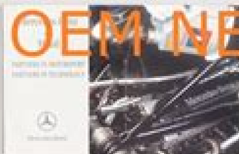
Engine compartment (left side)