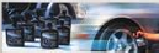
Wheel and tire