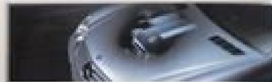
Engine compartment (right side) (left side)