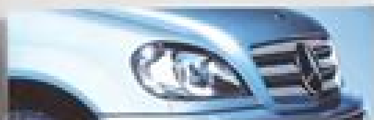
Engine compartment (front)