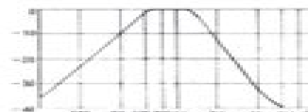
Band-pass Filter Characteristics