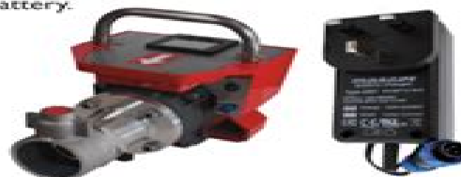
The Flowmaster 250DL MK2 and External Battery Charger