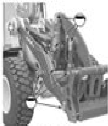
1 Power, Right Side View