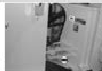
4 Front View of Ports

Lubricate daily when operating in severe conditions such as deep track, water, or snow.