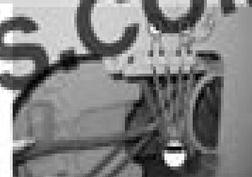
5 Rear View

Lubricate daily when operating in severe conditions such as deep track, water, or snow.