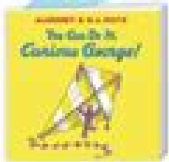
You Can Do It, Curious George! Fairy