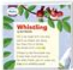
Poems About Things You Can Do Poetry