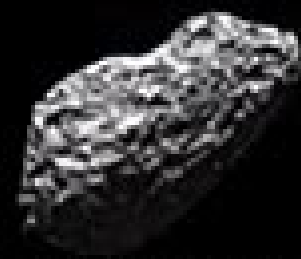
astéroïdes & comètes