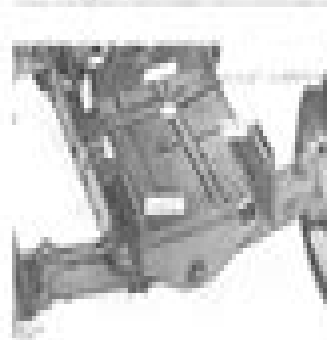
Fig. 5 Tractor engine assembly

Tractor engine assembly consists of the following components: Cylinder head Piston Crankshaft Main bearings Flywheel