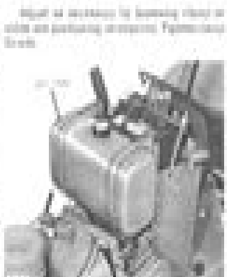
Fig. 8 Tractor engine assembly

Tractor engine assembly consists of the following components: Cylinder head Piston Crankshaft Main bearings Flywheel