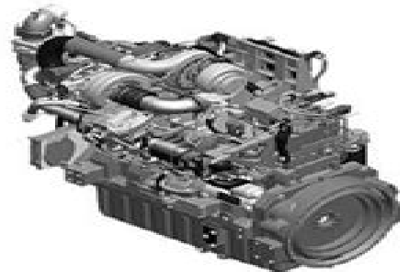
Final Tier 4 5000 Engine — Left Rear View