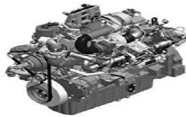
Final Tier 4 5000 Engine — Left Front View