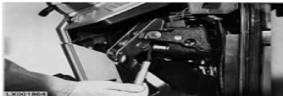
LX001864-UN: Adjusting Brake Pedals