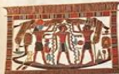
4 Ancient Egyptian artwork of a funeral boat