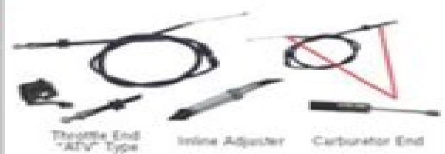
T3 ATV STYLE THROTTLE CABLES