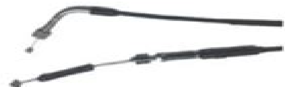
T5 STYLE THROTTLE CABLES