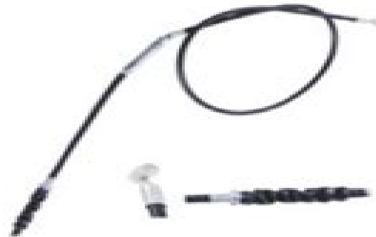
C2 STYLE CLUTCH CABLES