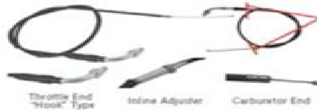
T2 HOOK STYLE THROTTLE CABLES