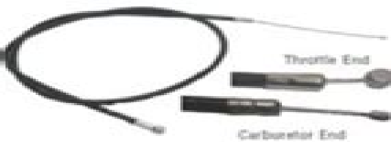
T1 STYLE THROTTLE CABLES