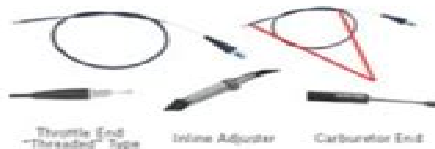
T4 STYLE THROTTLE CABLES