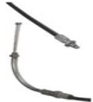
SC STYLE SHIFT CABLES