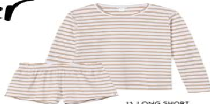
13. LONG SHORT PAJAMA SET