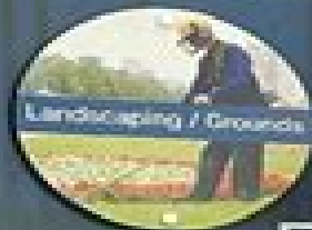
Landscaping / Grounds