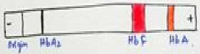
Sickle cell anemia.