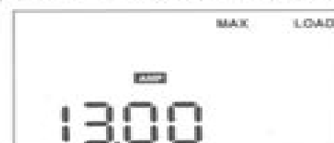
IMAGEN 10 Visualización de la carga máxima