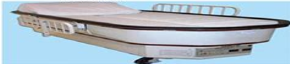
Fluidized Therapy Bed