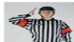
Charge à la tête CTN 124