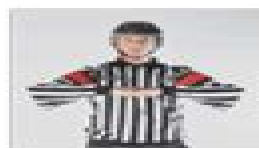
Charge tardive CH-T 153