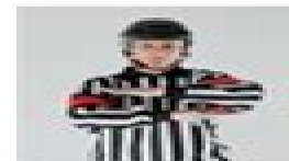
Harponner bout manche HBM 121