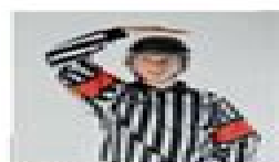
Pénalité de match MAT 110