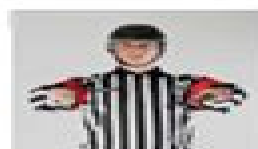
Charge avec la crosse CRO 127