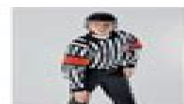
Coup de genou GEN 152