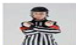
Obstruction OBS 149-172