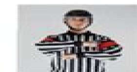
Charge incorrecte INC 122