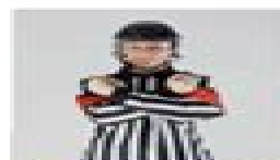
Obstruction sur GB OB-G 150