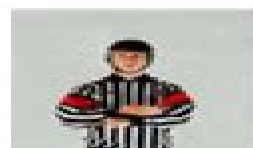
Cinglage CIN 159