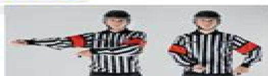
Accrocher ACC 146