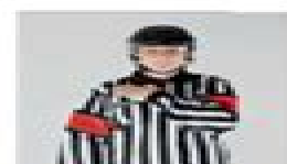
Charge illégale CCO 169