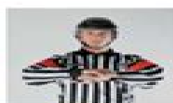
Retenir RET 144