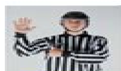
Surnombre SUR 166