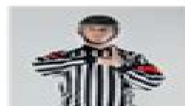
Projection contre la bande CBA 119