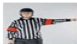
Dureté DUR 158 Bagarre C-PO 141