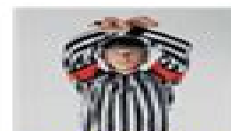
Tir de pénalité TP 170