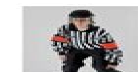
Coupage CPA 125