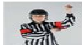
Crosse haute HAU 143