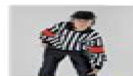
trébucher TRE 167