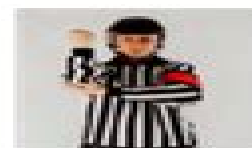
Coup de coude COU 139