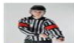
Piquage PIQ 161