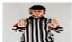
Charge par derrière DOS 123