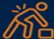
REPETITIVE STRAIN INJURIES