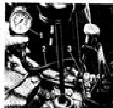
Bild 4 - Prüfen des Betriebsdruckes (speziell an Anschluß für die Zapfenbohrung)

Wird in Betrieb gesetzt und mit einer Drehzahl von 540 U/min laufen lassen. Das Öl durch das Gehäuse des Zapfenbohrschaltteils auf normale Betriebsdrucke bringen, Zapfenwelle anfahren, das Betriebsdruck auf in beiden Endstellungen des Zapfenbohrschaltteils gleich sein. Einziges Betriebsdruck oder Betriebsdruck.