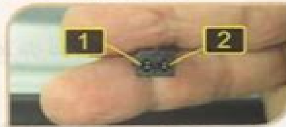
Conector da 3ª luz de freio (Brake-light)