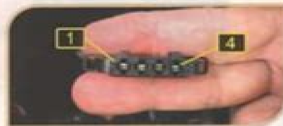
Conector do IPF (TC 1155)