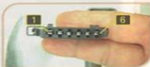
Conector das lanternas (TC 1128)