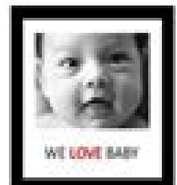
Baby photo album