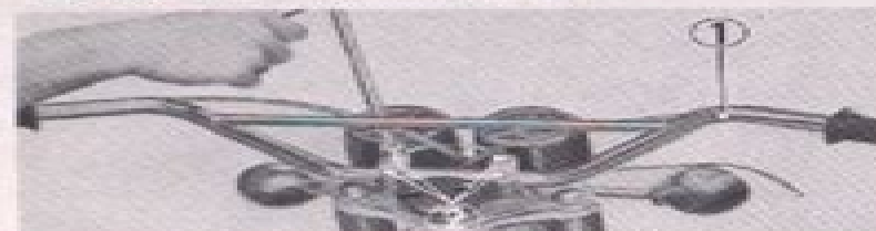
① Steering handle pipe ② 8mm hex. bolt