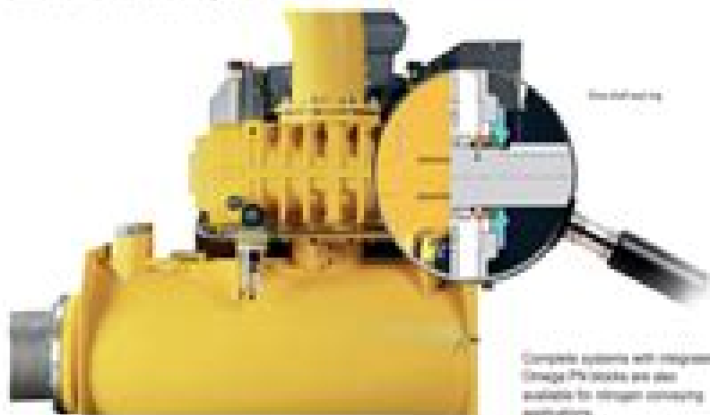
Complete systems with integrated Omega PN blower are also available for nitrogen conveying applications.

Leakages from all system components – including rotary blowers – should therefore be kept to an absolute minimum. For such applications, specially-developed PN series blowers are available with three different drive shaft sealing technology, as well as wear-free slide ring seals.