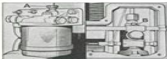
Fig. L1—On HR3 and HRW3 models, bleed screws are located at "A" on fuel filter body and "B" on fuel pump. Refer to text.

If operating temperatures fall below 10°F., an SAE 10W weight oil is recommended. In temperatures between 10° to 85°F. use SAE 20-20W and above 85°F. use SAE 30 or 10W-40.