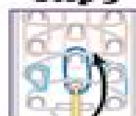
Grab the blue band on the center pin