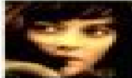
Character Name: Marion Cotillard Role: Dr. Emily Hollister