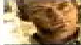
Character Name: Jesse Eisenberg Role: Dr. Michael G. Stone