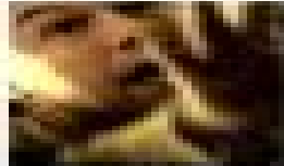
Character Name: Matt Damon Role: Dr. David Kowalski