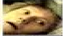
Character Name: Neve Campbell Role: Dr. Gail Peltz