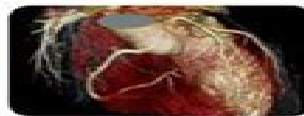
Cardiac Dual Source CT

New: Clinical Benefit of PET/CT Applications