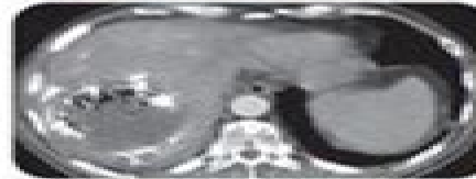
Hepatic FDG Uptake in PET/CT