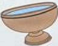
Bronze Basin (Laver)