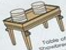
Table of Showbread