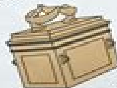
Ark of the Covenant