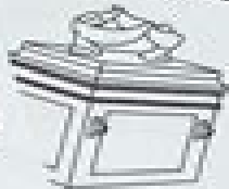
Ark of the Covenant