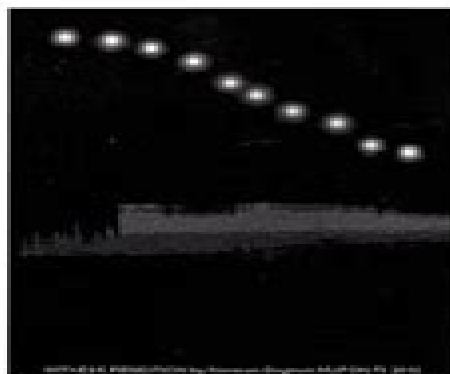
MUFON File # 2012