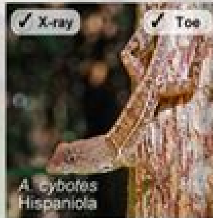
A. cybotes Hispaniola