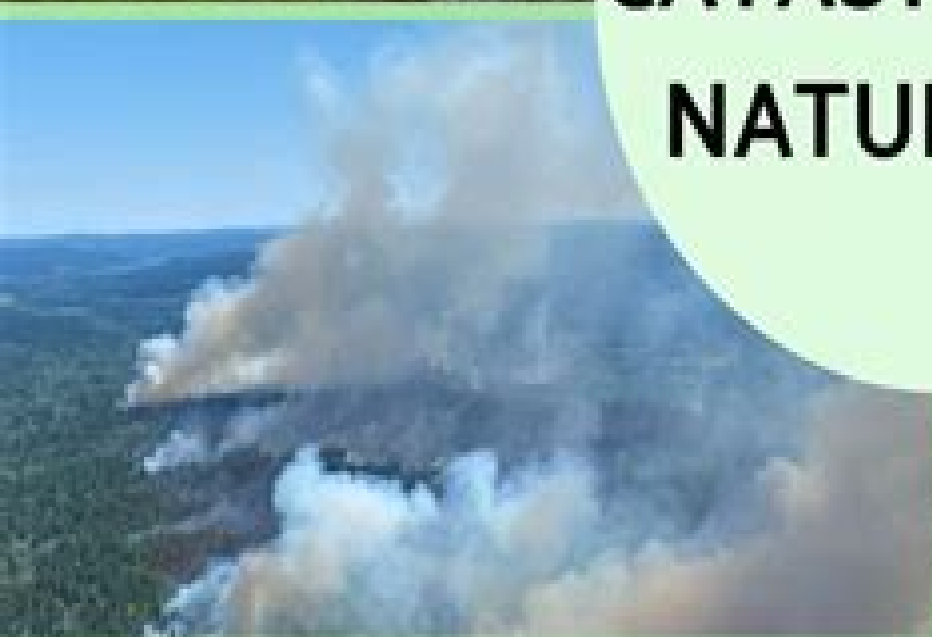
VAGUE DE CHALEUR EN COLOMBIE-BRITANNIQUE