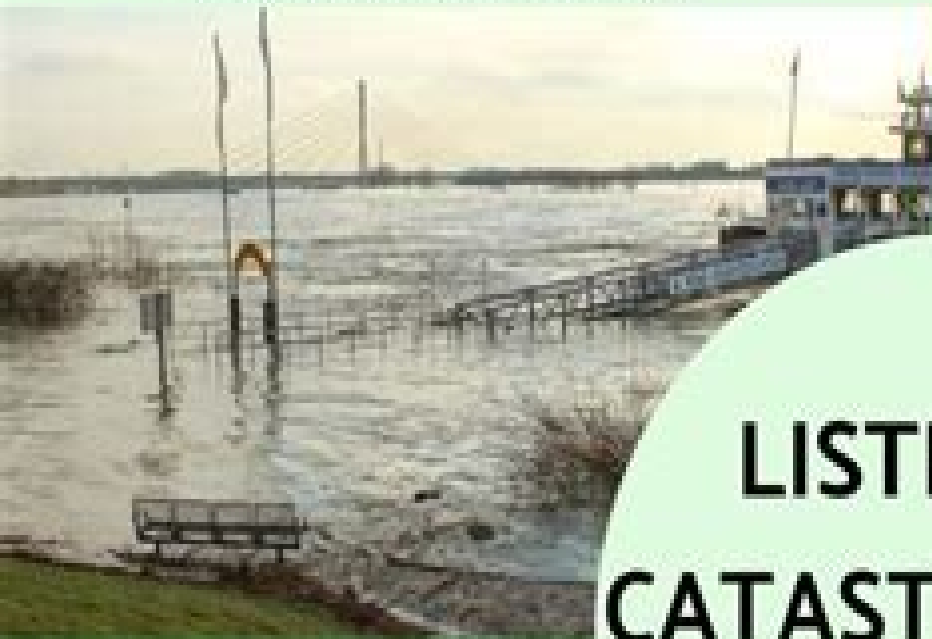
INONDATIONS EN EUROPE