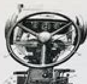
FIG. A.407 INSTRUMENT PANEL AND REAR AXLES

25. Fly wheel, 27. Rear drive shaft, 28. Starting and overrunning gears