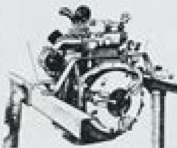
FIG. A.409 INSTALLING ENGINE ON TURNOVER STAND