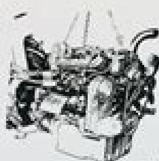
FIG. A.408 REMOVED ENGINE FROM CHASSIS