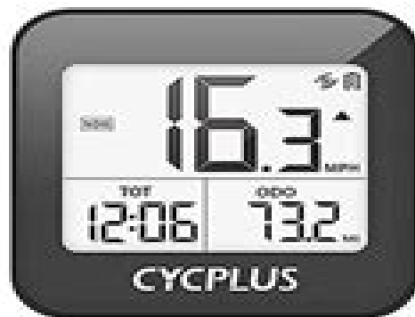
GPS bike computer