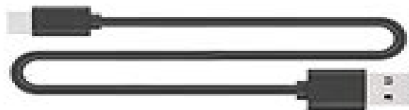
Micro usb charging cable