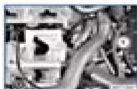
Remove coolant hose (1).