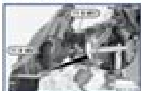
Apply special tool (1) and (2) to the alternator (3).

Remove mounting bolt (1) for the alternator and remove the alternator (2) with the alternator (3) at the coolant hose. Remove mounting bolt (1) for the alternator (2) and the alternator (3). Remove the alternator (2) and the alternator (3). Tightening torque (1) 10 Nm Tightening torque (2) 10 Nm Tightening torque (3) 10 Nm