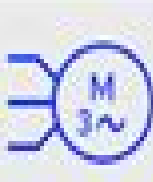
Three-Phase Electric Motor