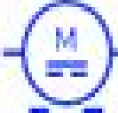
Permanent Magnet DC Motor