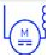
DC Series Motor