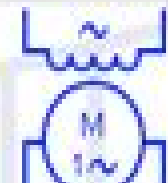
Single-Phase Repulsion Motor