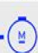
DC Compound Excitation Motor