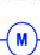
Generic Motor Symbol