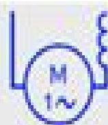
AC Single-Phase Series Motor