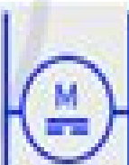
DC Shunt Motor