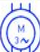
Three Phase Wound Rotor Motor