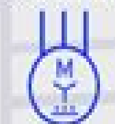
Three-Phase Star Shaped Motor