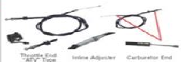
T3 ATV STYLE THROTTLE CABLES