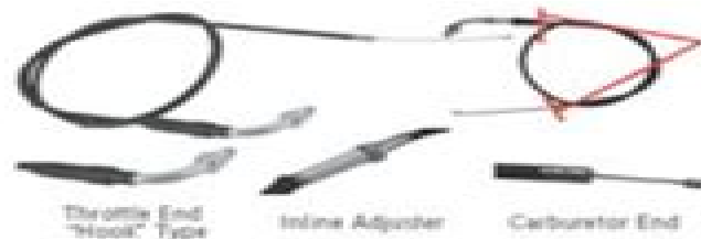
T2 HOOK STYLE THROTTLE CABLES