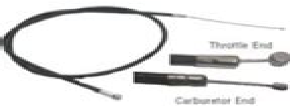
T1 STYLE THROTTLE CABLES