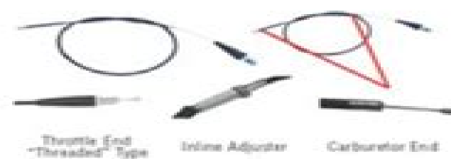
T4 STYLE THROTTLE CABLES