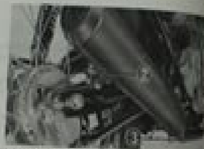
Fig. 2-29 (A) Screen (B) Cover plate (C) Drain plug