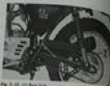
Fig. 2-28 (A) Rear fork (B) Rear shock absorber