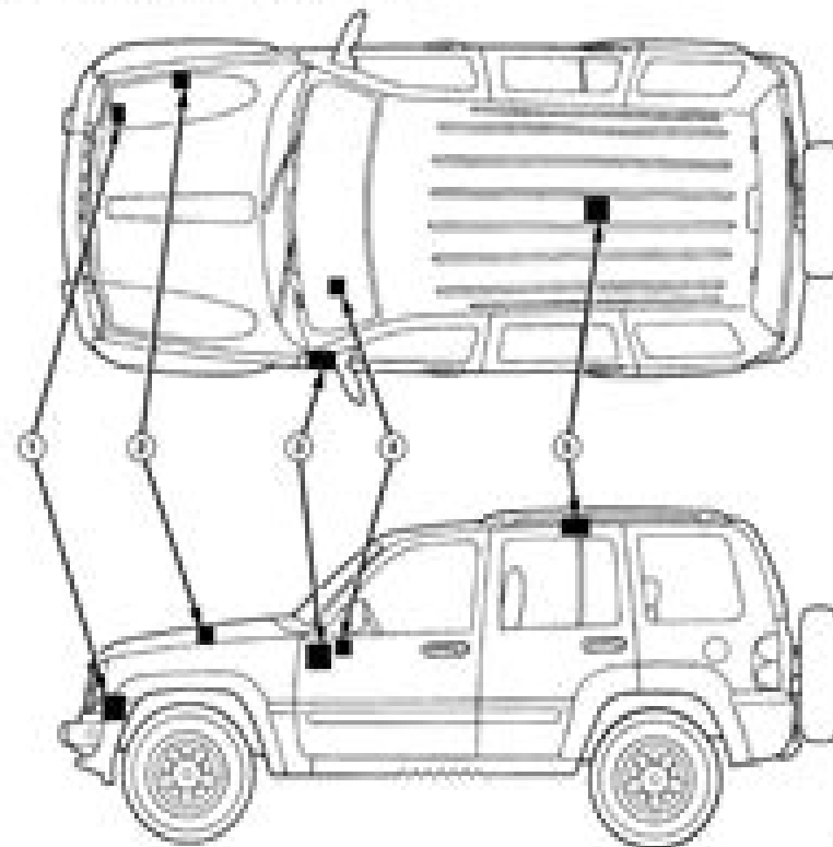
Fig. 2 Vehicle Theft Security System