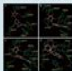
Fig. 2 Fluorescence spectra of Baocou (Baocou 1, Baocou 2, Baocou 3, and Baocou 4) under different conditions. The fluorescence peak position of Baocou 1 and Baocou 2 are represented using yellow dotted line. The fluorescence peak position of Baocou 3 and Baocou 4 are represented using red dotted line.

3. Chen-Chen Liu, Min Hu, Ai-Di Wu*, Chen-Chen Zhu* Investigation on the difference of four Baocou with similar structure leading to human acute allergic. Journal of Pharmaceutical Analysis , 2014, 4(3): 142-148.