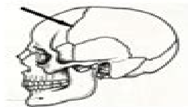
a. Fixed joint